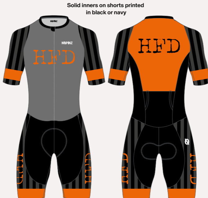
PRO 1 EVO TRISUIT