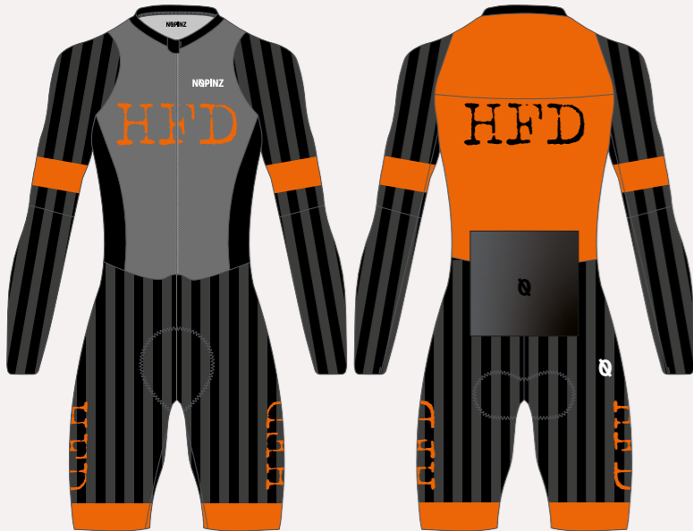
HYPERSONIC LIGHT SUIT