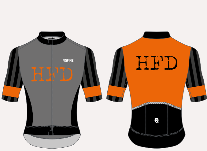
PRO-1 EVO JERSEY