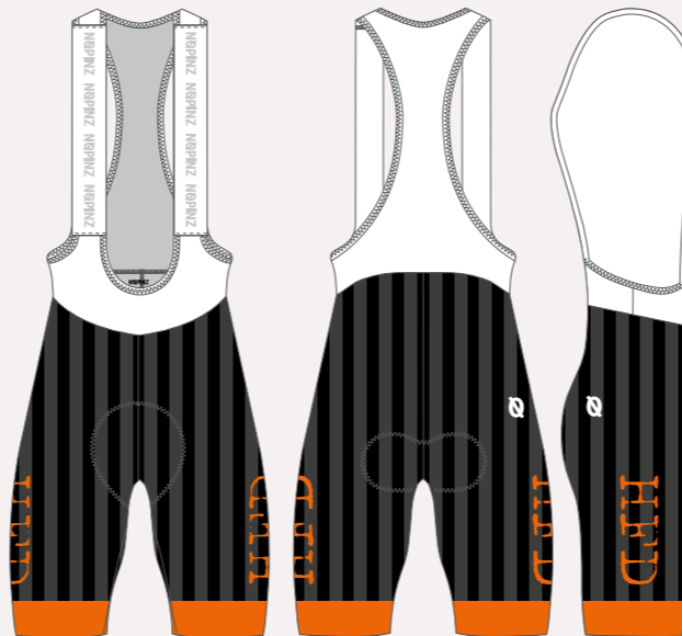
PRO-1 EVO BIB SHORTS