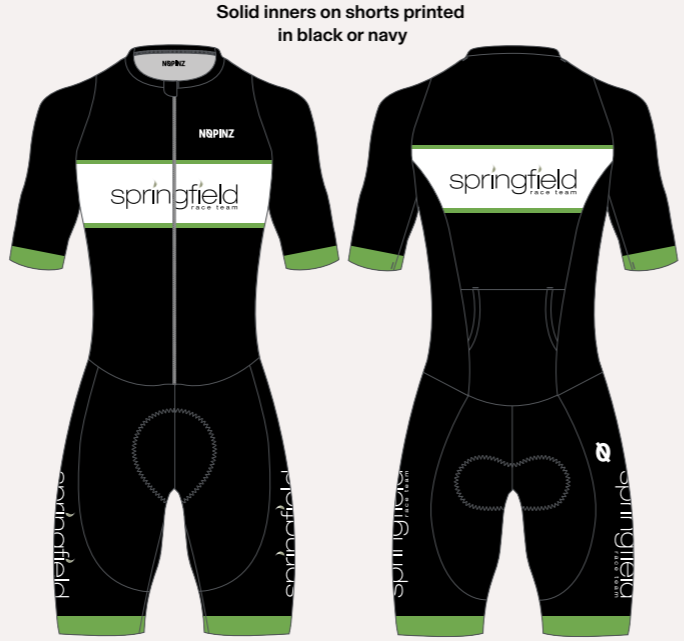
PRO 1 EVO TRISUIT