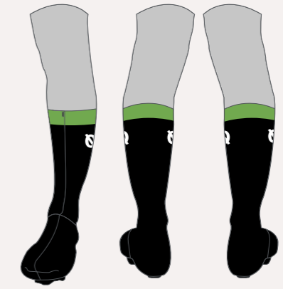
HYPERSONIC OVERSHOES UCI