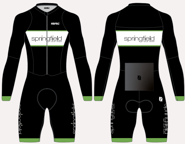
HYPERSONIC LIGHT SUIT