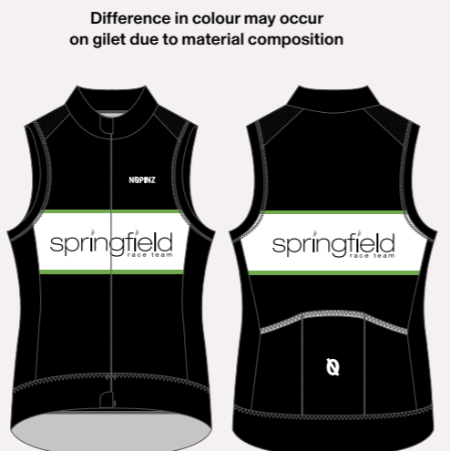
PRO-1 EVO GILET