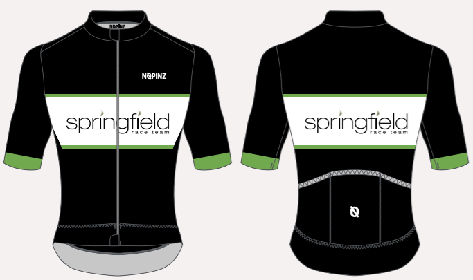
PRO-1 EVO JERSEY