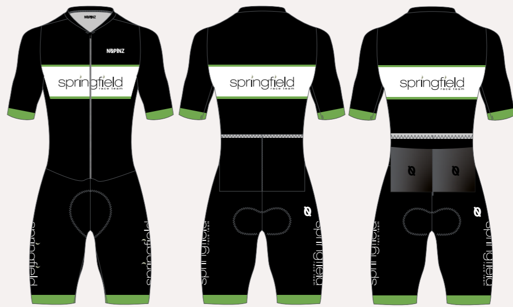
PRO-1 EVO RR SUIT