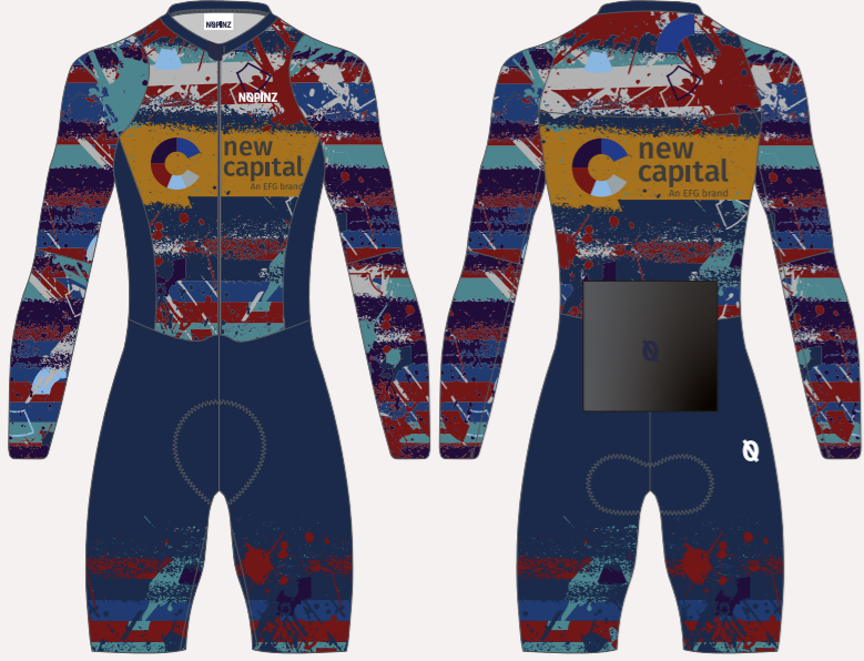
HYPERSONIC LIGHT SUIT