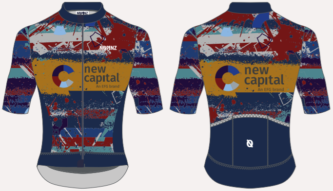
PRO-1 EVO JERSEY