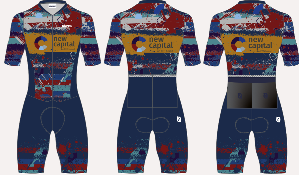
PRO-1 EVO RR SUIT