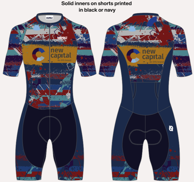
PRO 1 EVO TRISUIT