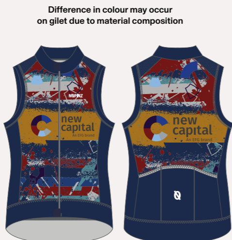
PRO-1 EVO GILET