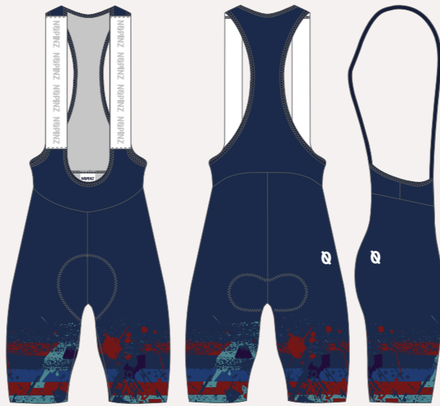
PRO-1 EVO BIB SHORTS