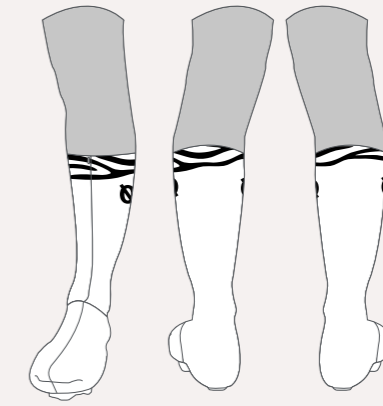
HYPERSONIC OVERSHOES UCI