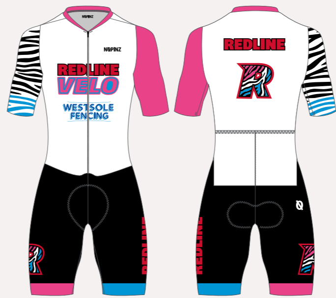
PRO-1 EVO RR SUIT