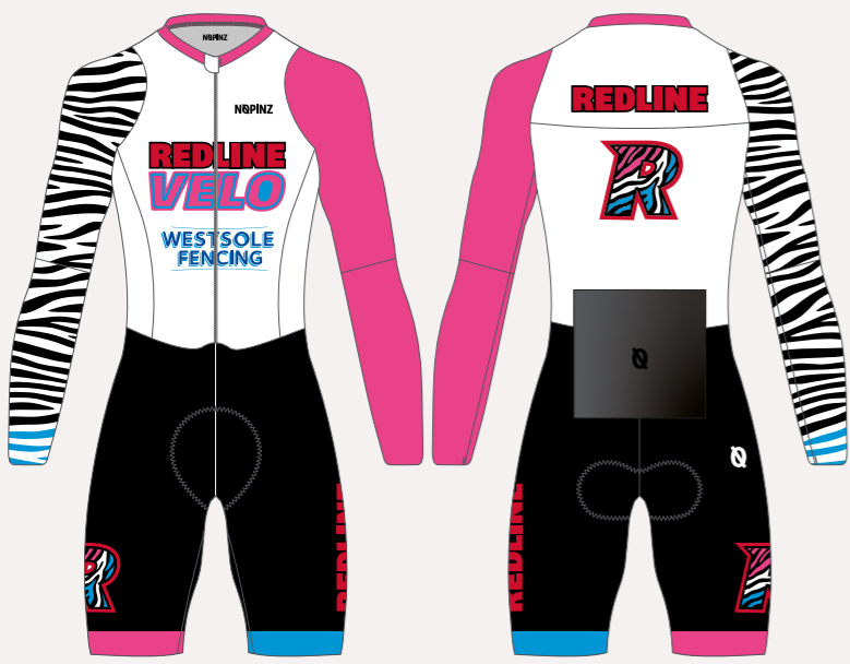
HYPERSONIC LIGHT SUIT