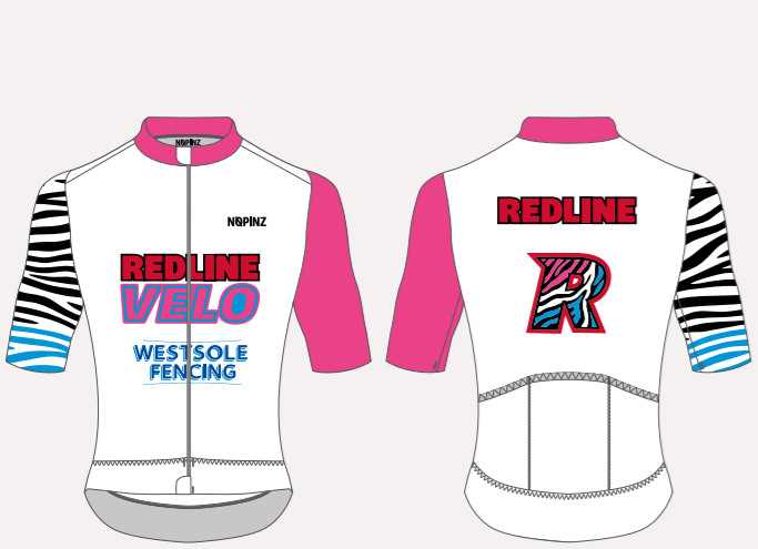
PRO-1 EVO JERSEY