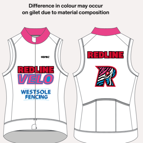
PRO-1 EVO GILET