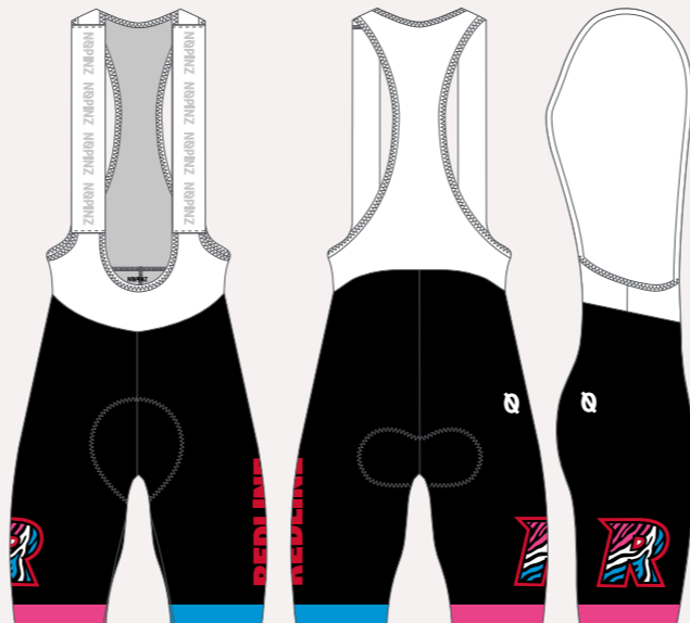
PRO-1 EVO BIB SHORTS