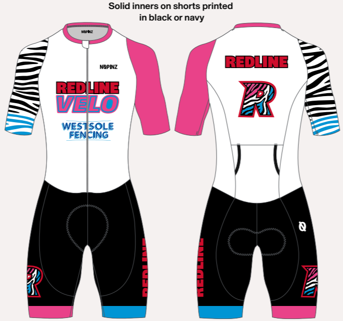
PRO 1 EVO TRISUIT