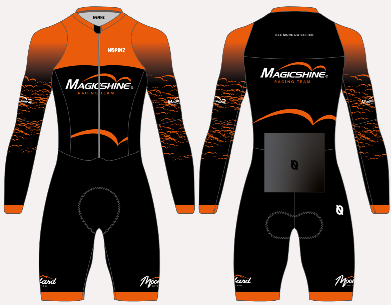
HYPERSONIC LIGHT SUIT