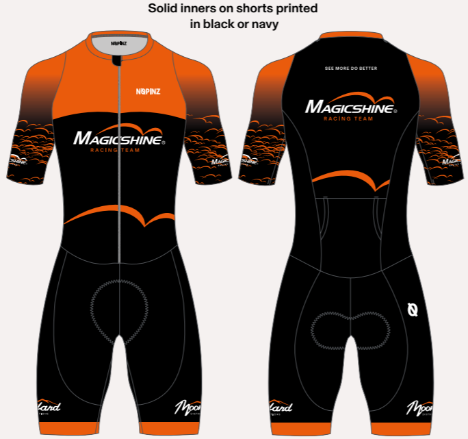
PRO 1 EVO TRISUIT