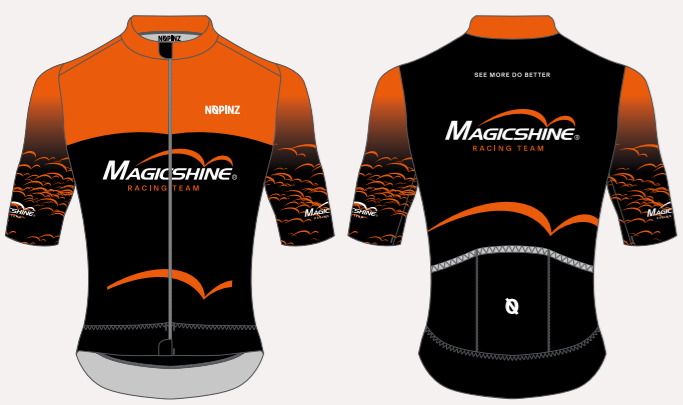
PRO-1 EVO JERSEY