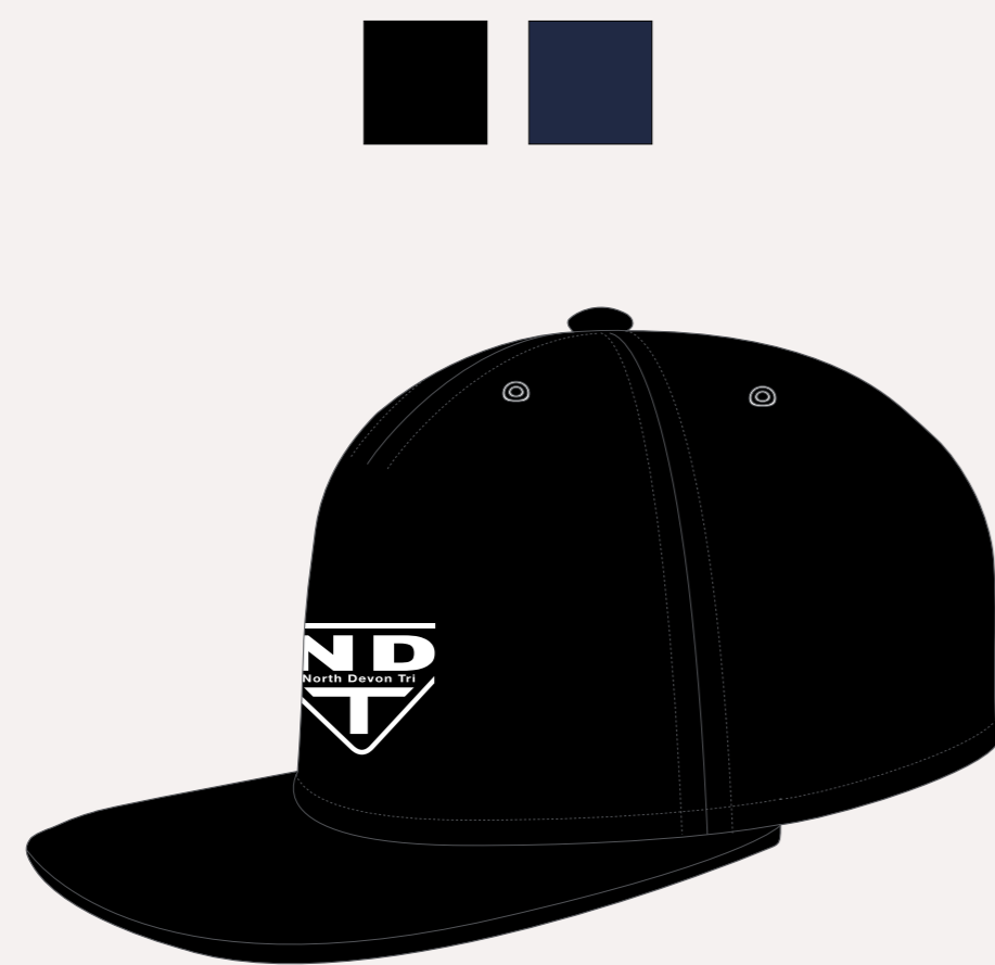
RACE DAY CAP