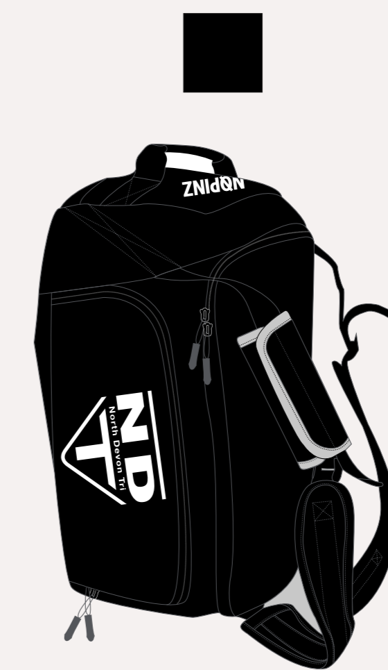
60 LITRE RACE DAY KIT BAG