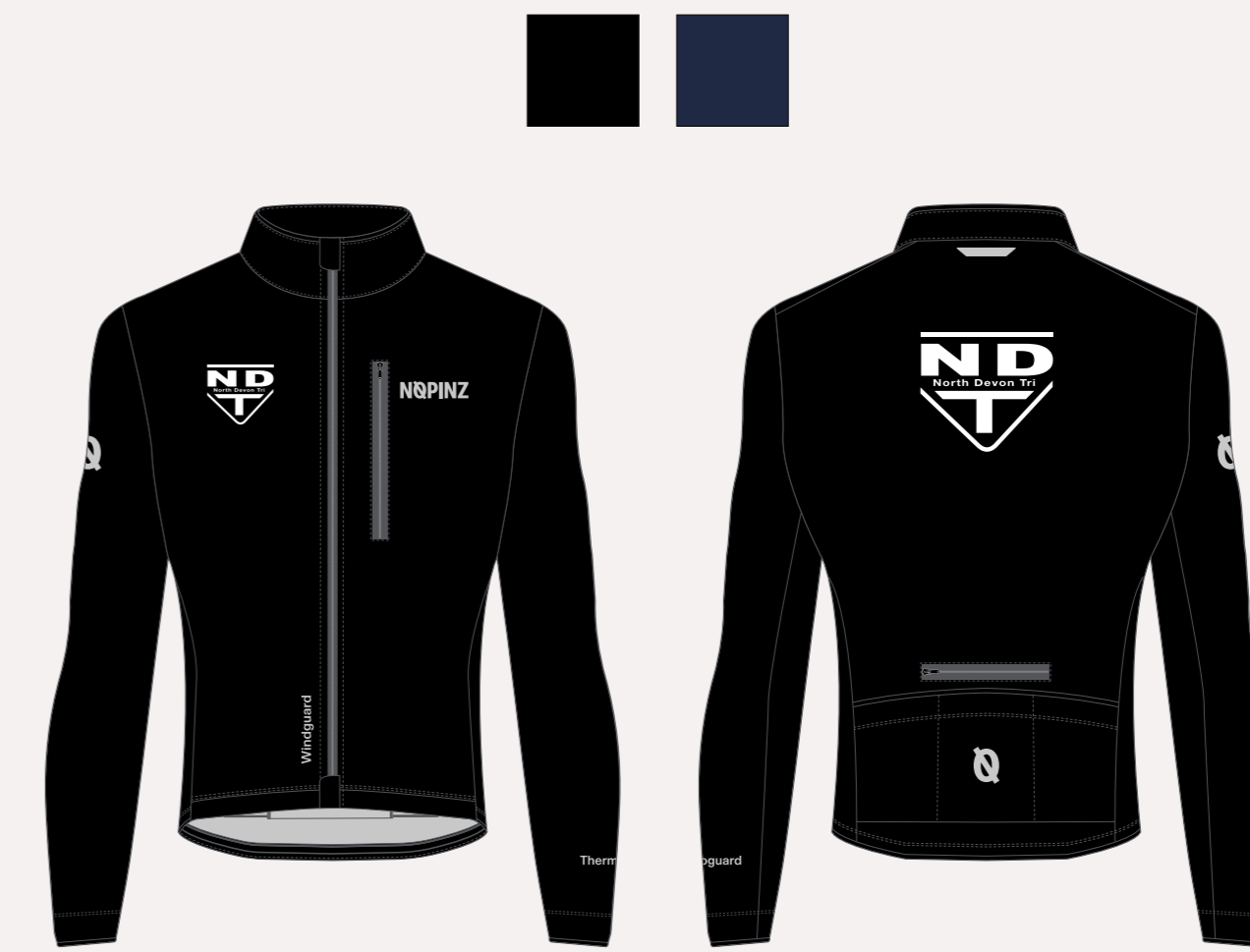
PRO-1 EVO BLIZZARD JERSEY