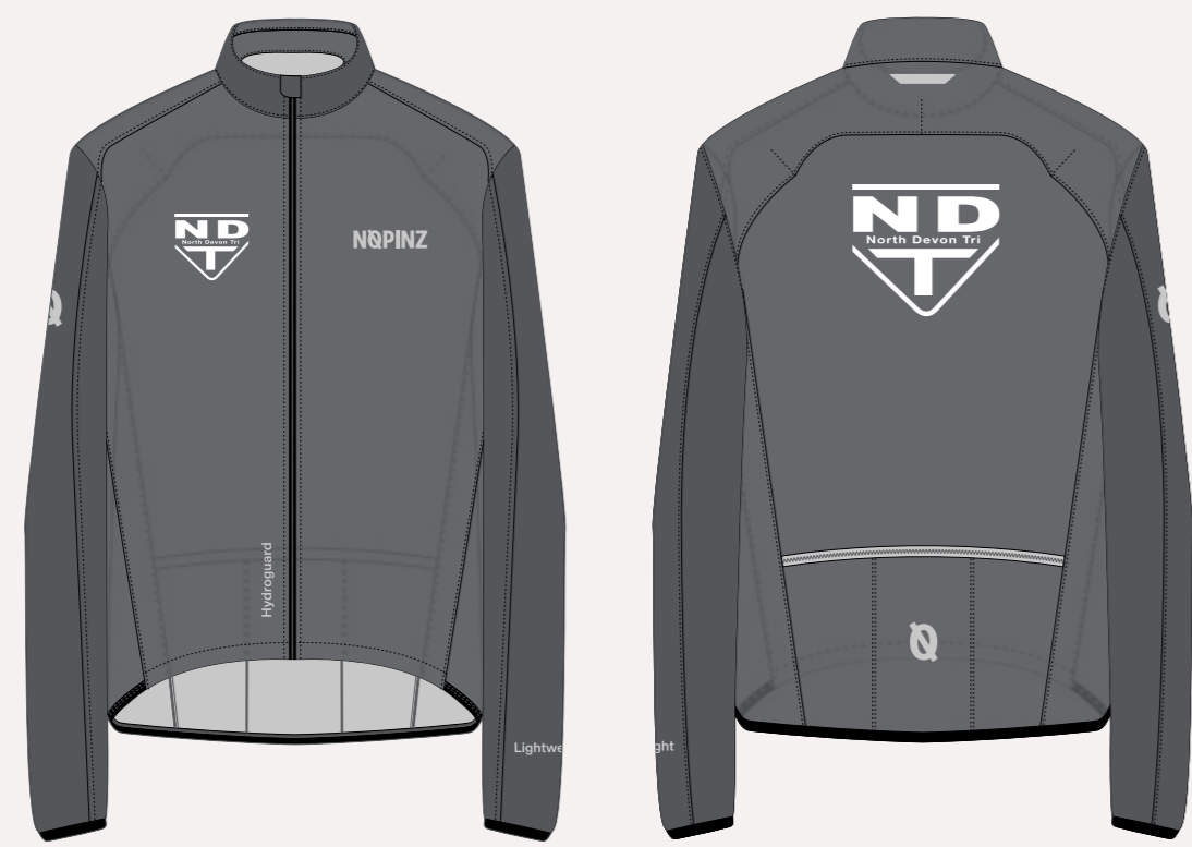
PRO-1 EVO RACE CAPE