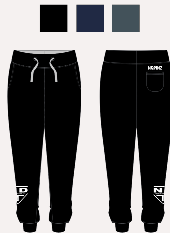
SLIM FIT CUFFED JOGGERS