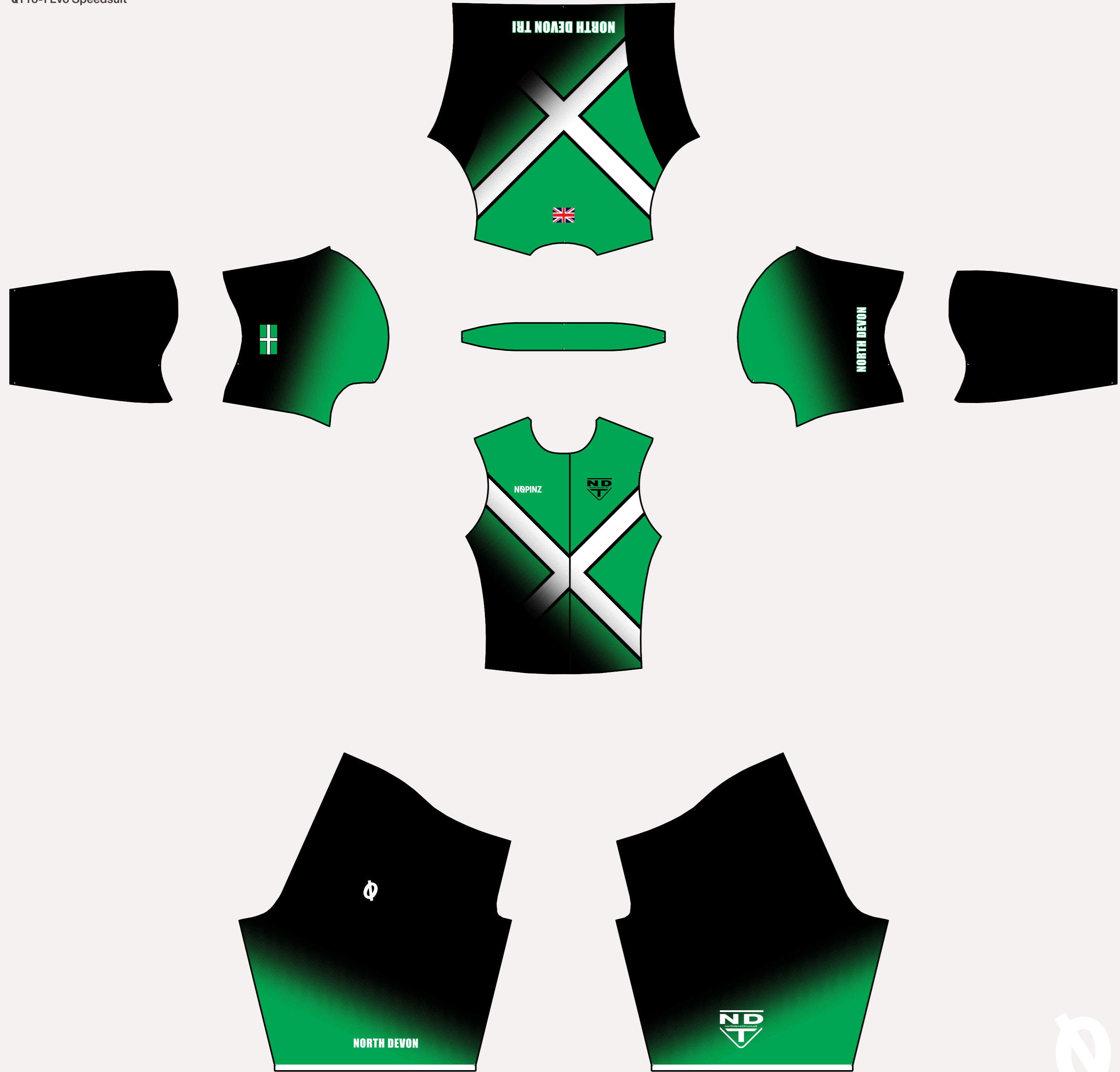
2D Production Template