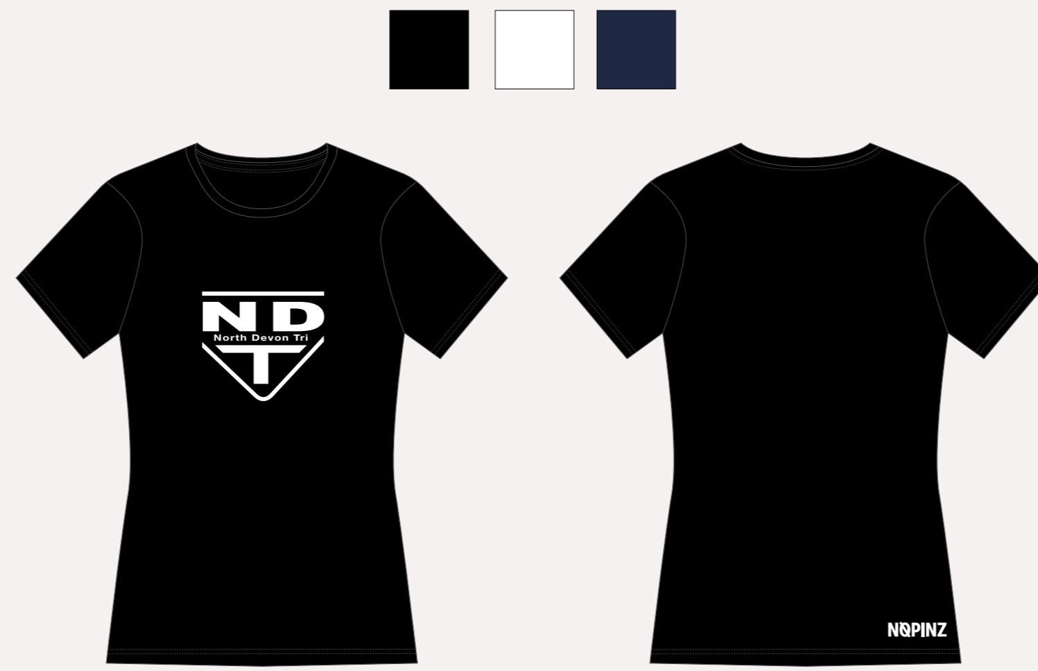
PERFORMANCE STRETCH T-SHIRT