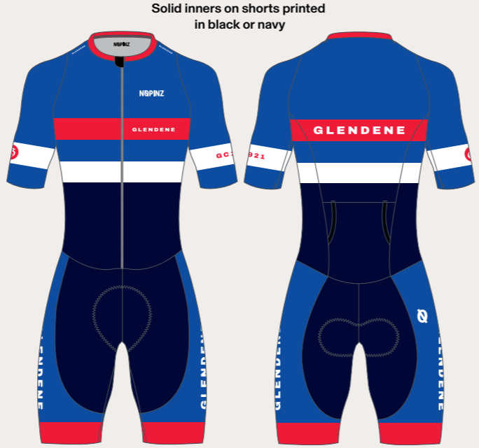
PRO 1 EVO TRISUIT