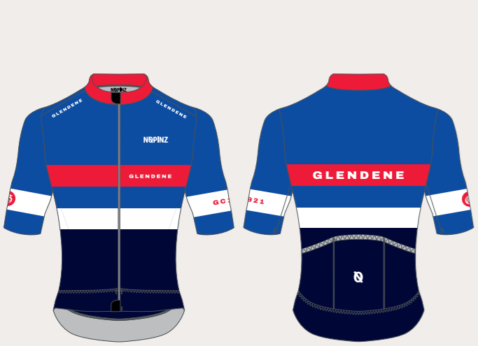
PRO-1 EVO JERSEY