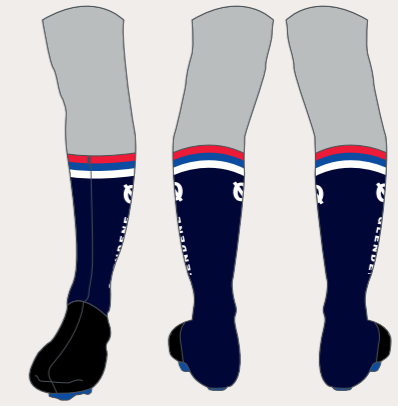
HYPERSONIC OVERSHOES UCI