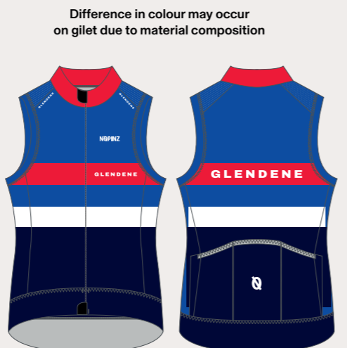
PRO-1 EVO GILET