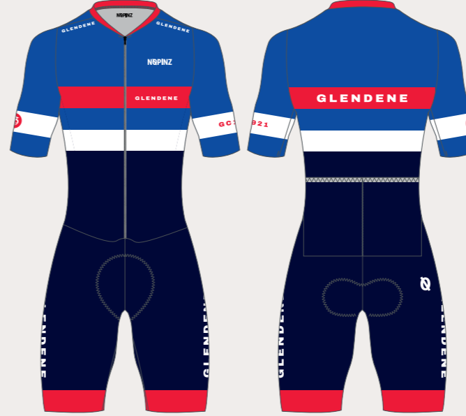
PRO-1 EVO RR SUIT