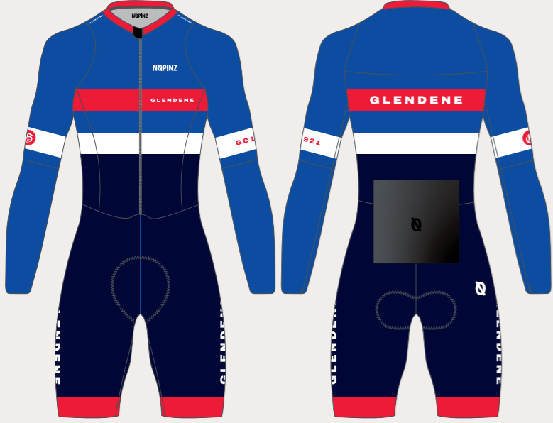
HYPERSONIC LIGHT SUIT