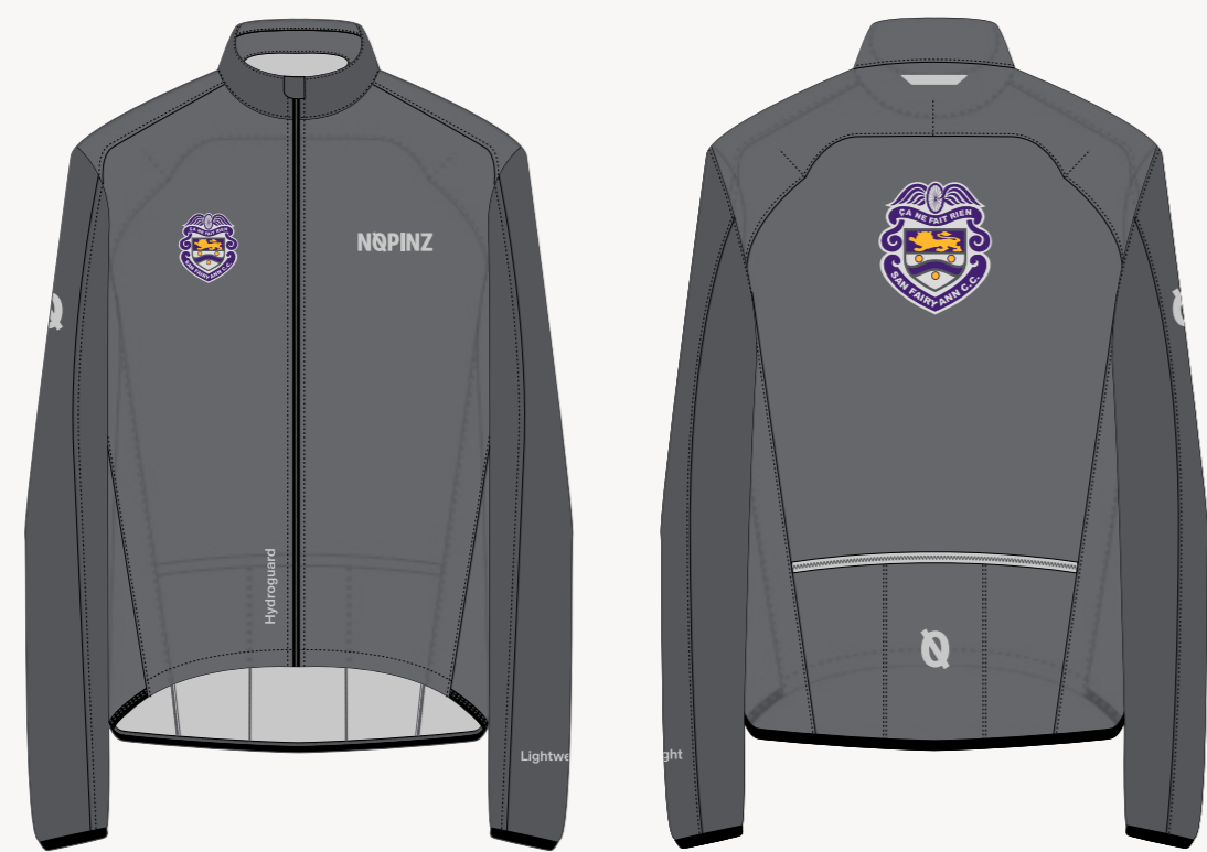
PRO-1 EVO RACE CAPE