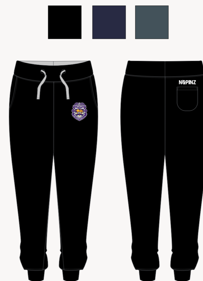
SLIM FIT CUFFED JOGGERS