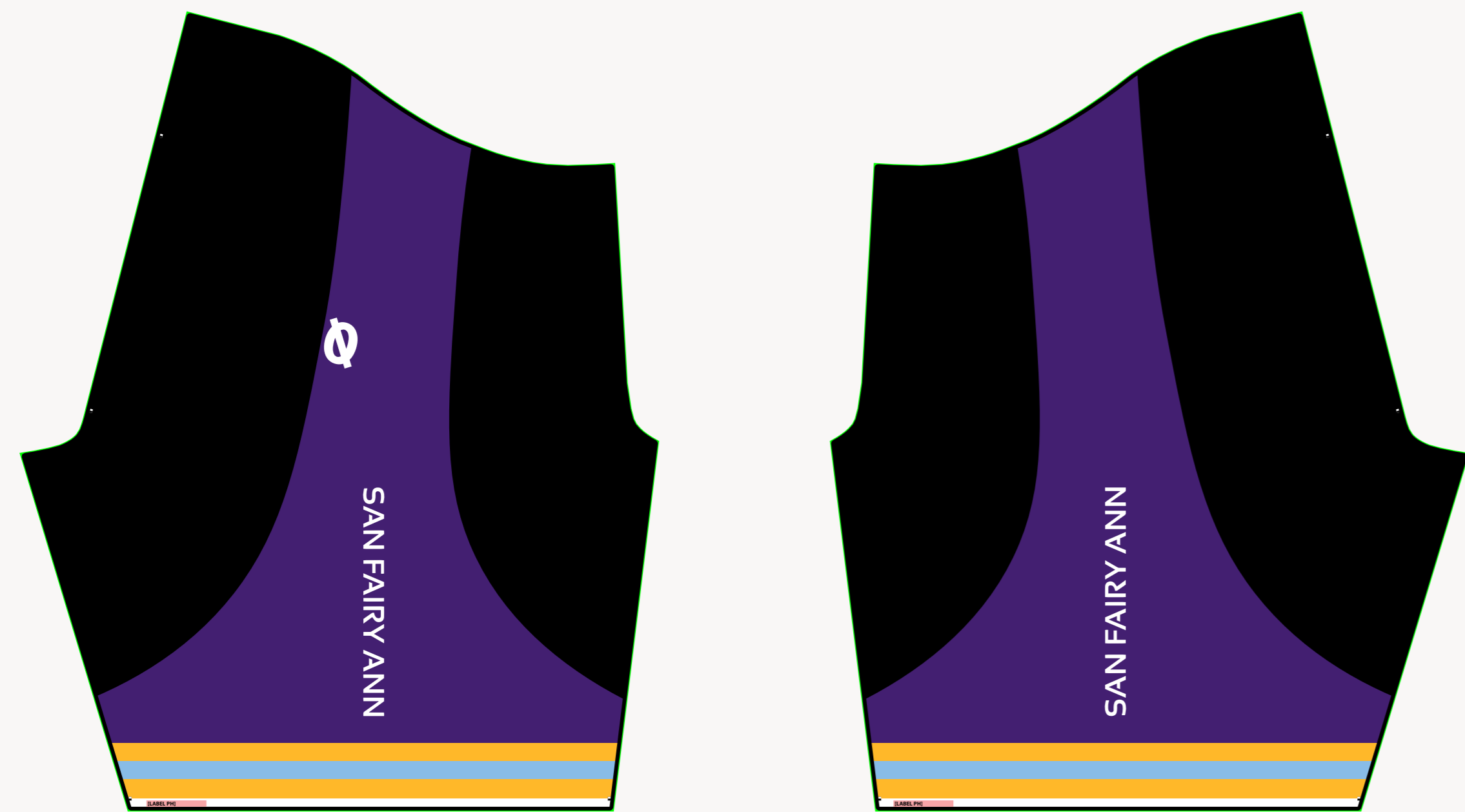
2D Production Template