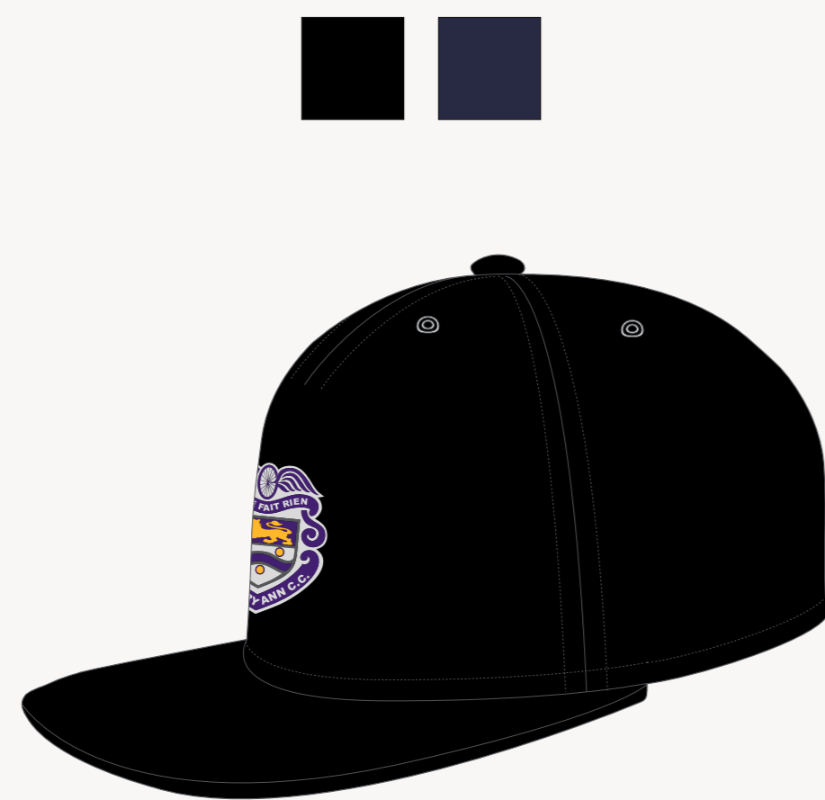
RACE DAY CAP