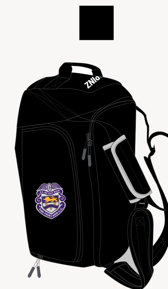
60 LITRE RACE DAY KIT BAG