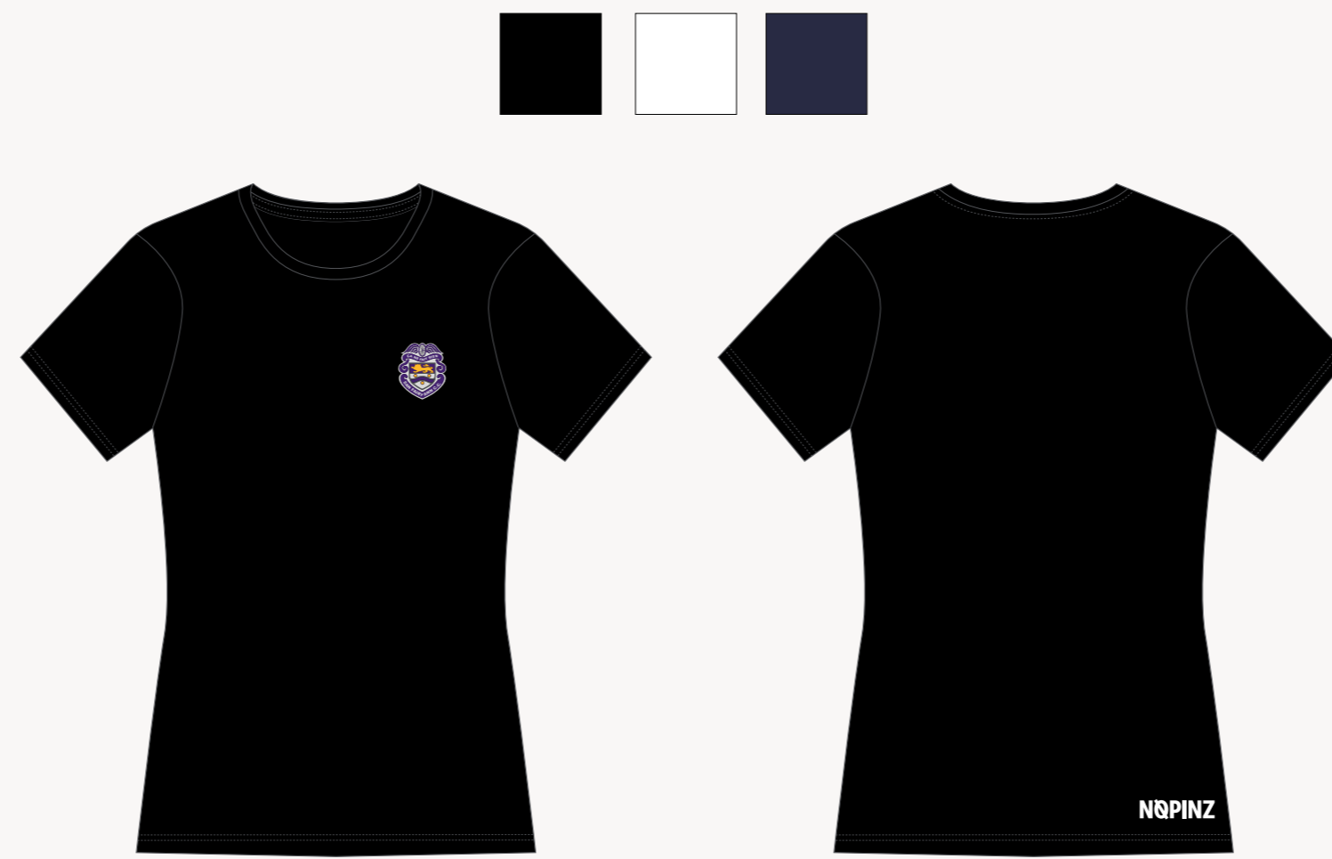
PERFORMANCE STRETCH T-SHIRT