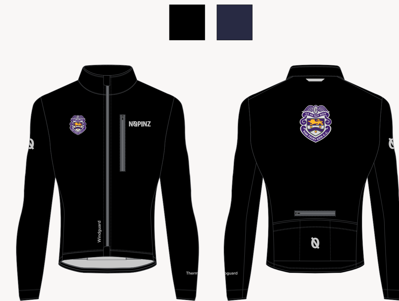
PRO-1 EVO BLIZZARD JERSEY