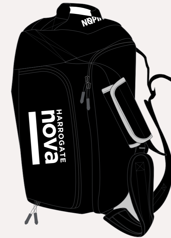
60 LITRE RACE DAY KIT BAG