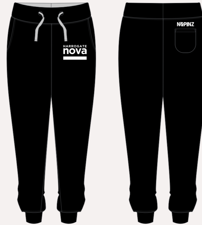
SLIM FIT CUFFED JOGGERS