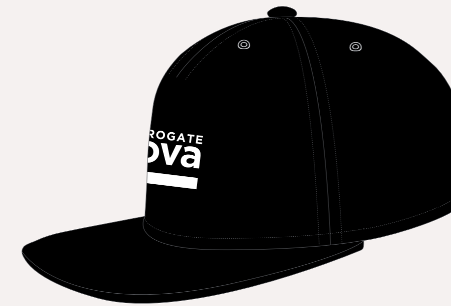
RACE DAY CAP