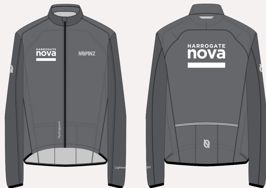
PRO-1 EVO RACE CAPE