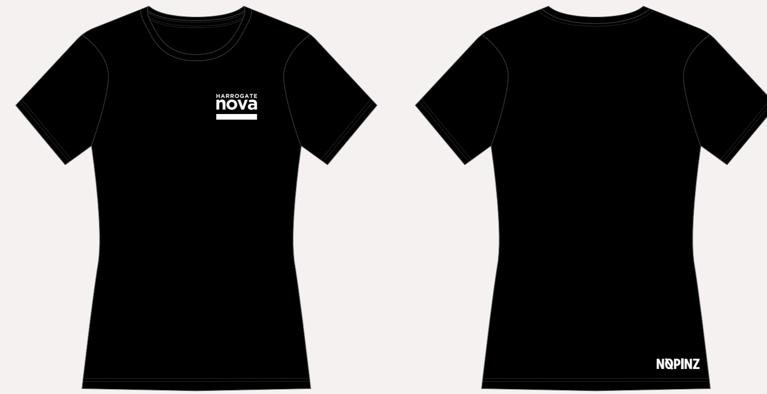
PERFORMANCE STRETCH T-SHIRT