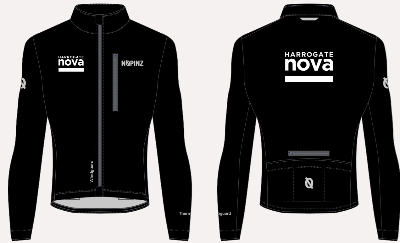
PRO-1 EVO BLIZZARD JERSEY