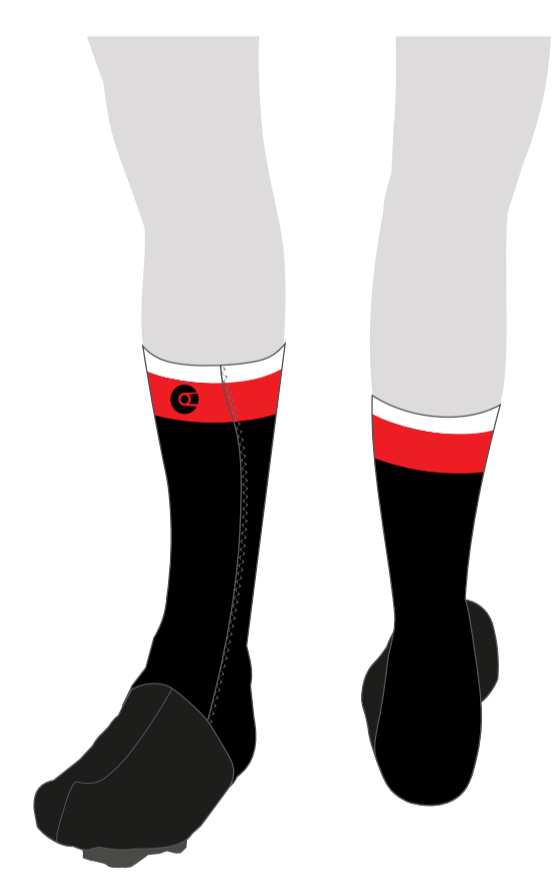
FLOW COVERS (UCI)