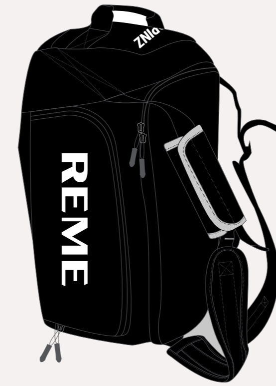
60 LITRE RACE DAY KIT BAG