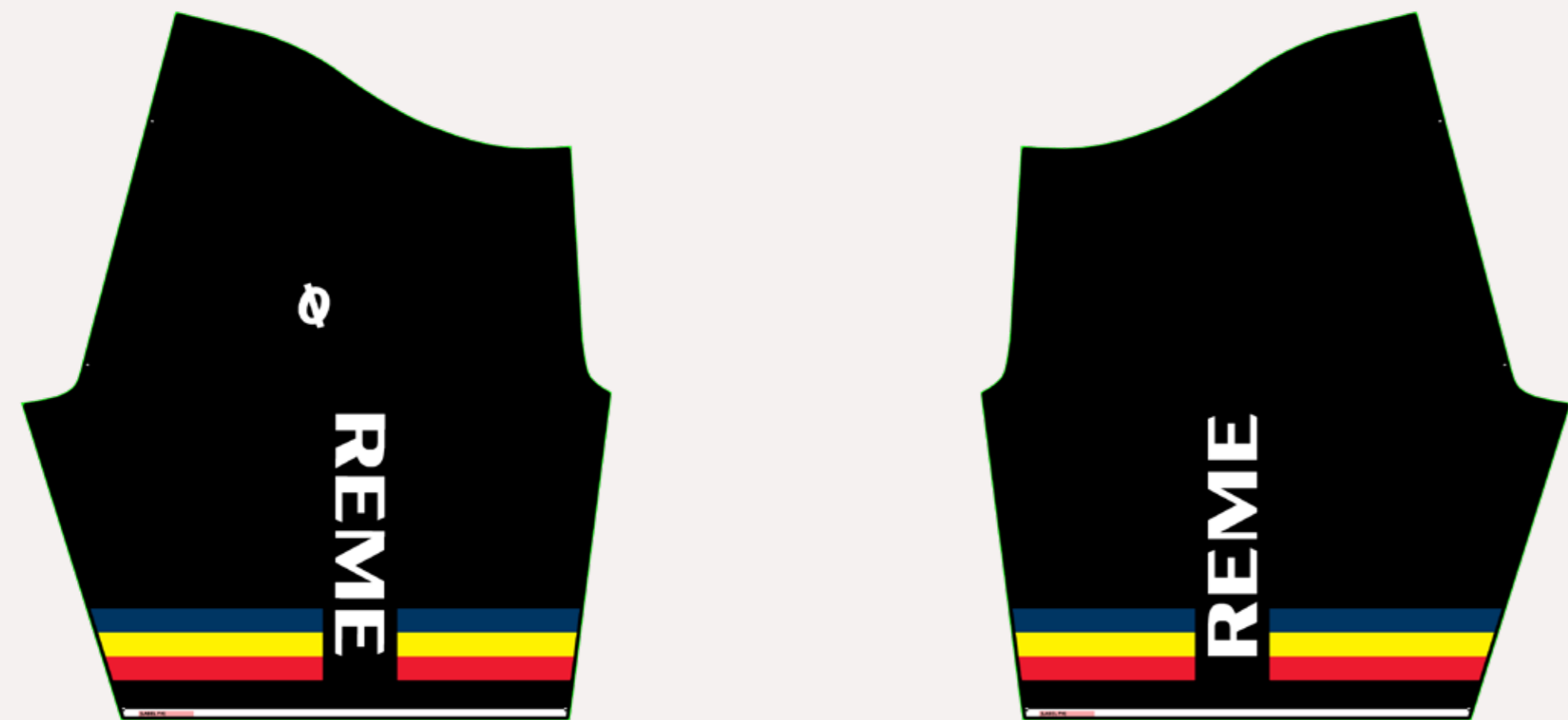
2D Production Template