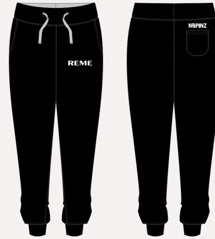
SLIM FIT CUFFED JOGGERS