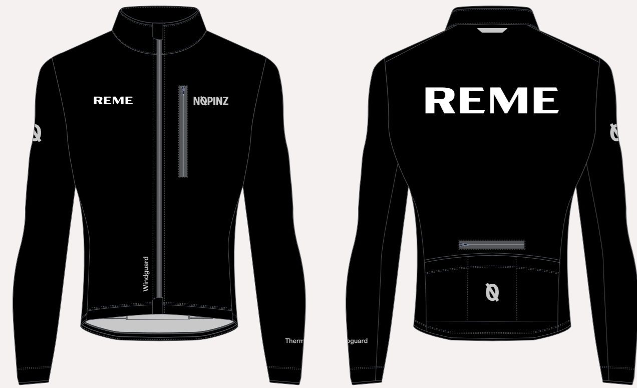
PRO-1 EVO BLIZZARD JERSEY