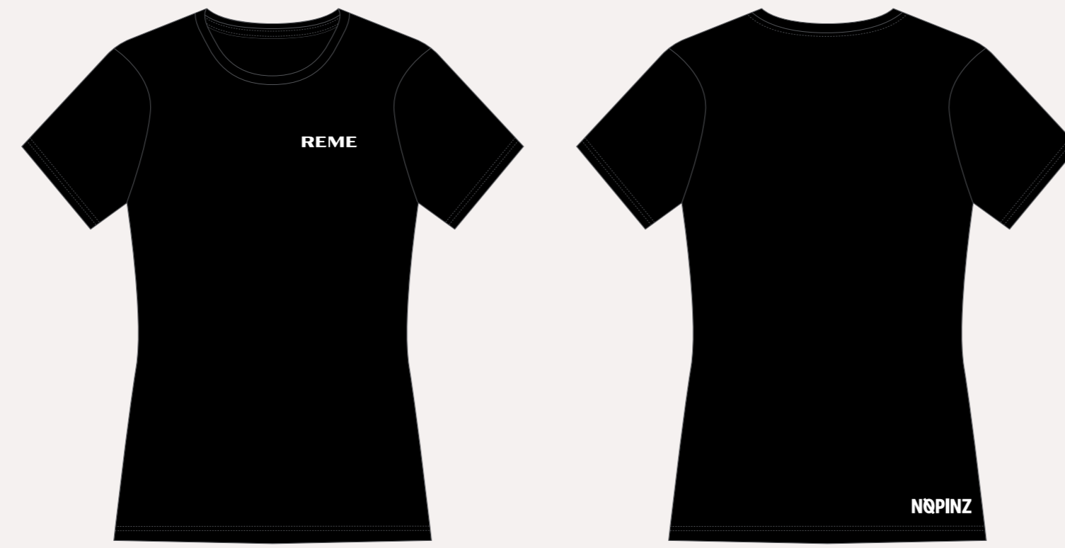
PERFORMANCE STRETCH T-SHIRT