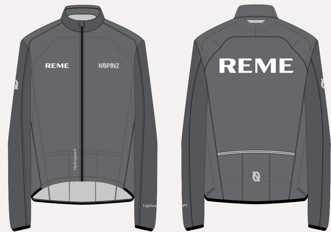
PRO-1 EVO RACE CAPE