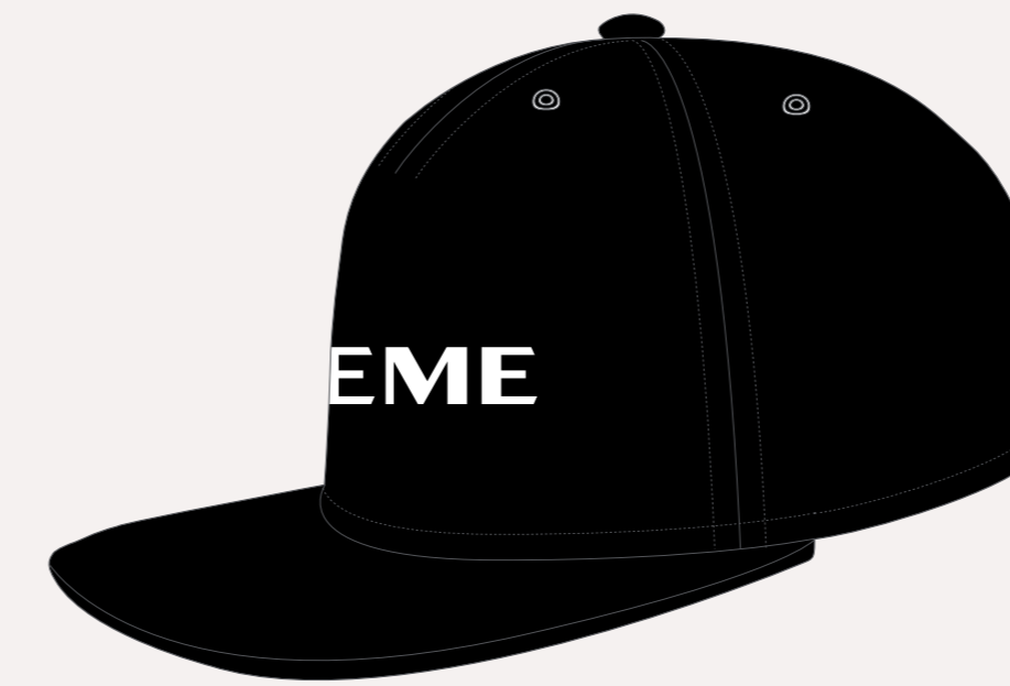
RACE DAY CAP