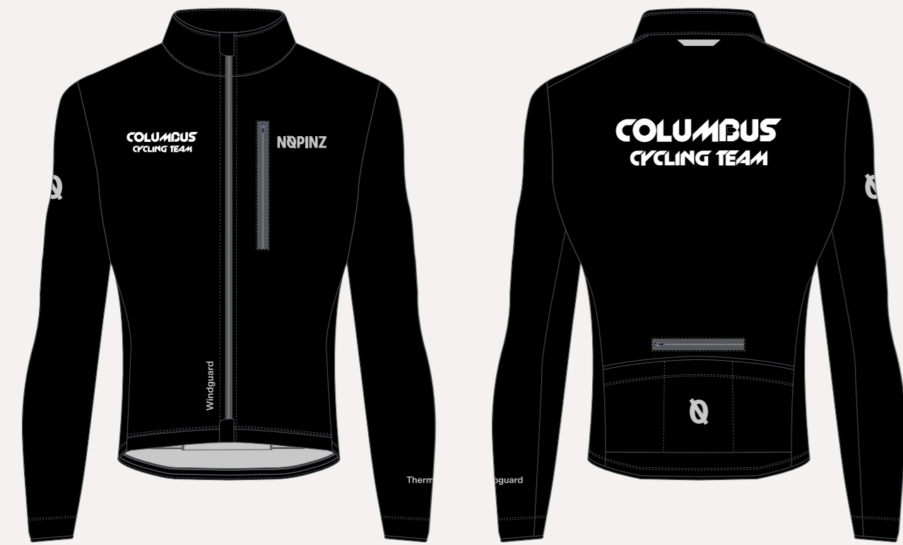
PRO-1 EVO BLIZZARD JERSEY