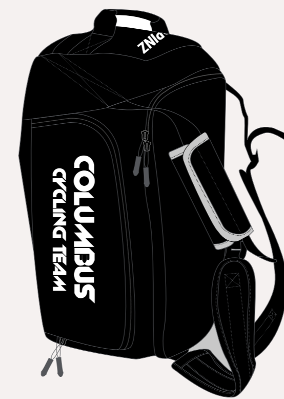
60 LITRE RACE DAY KIT BAG