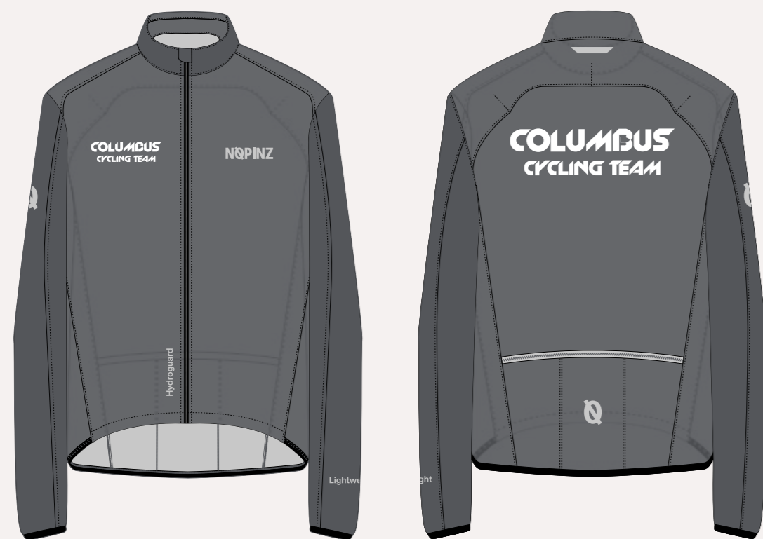
PRO-1 EVO RACE CAPE