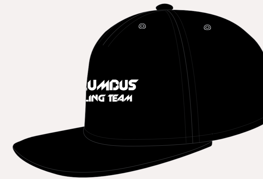
RACE DAY CAP