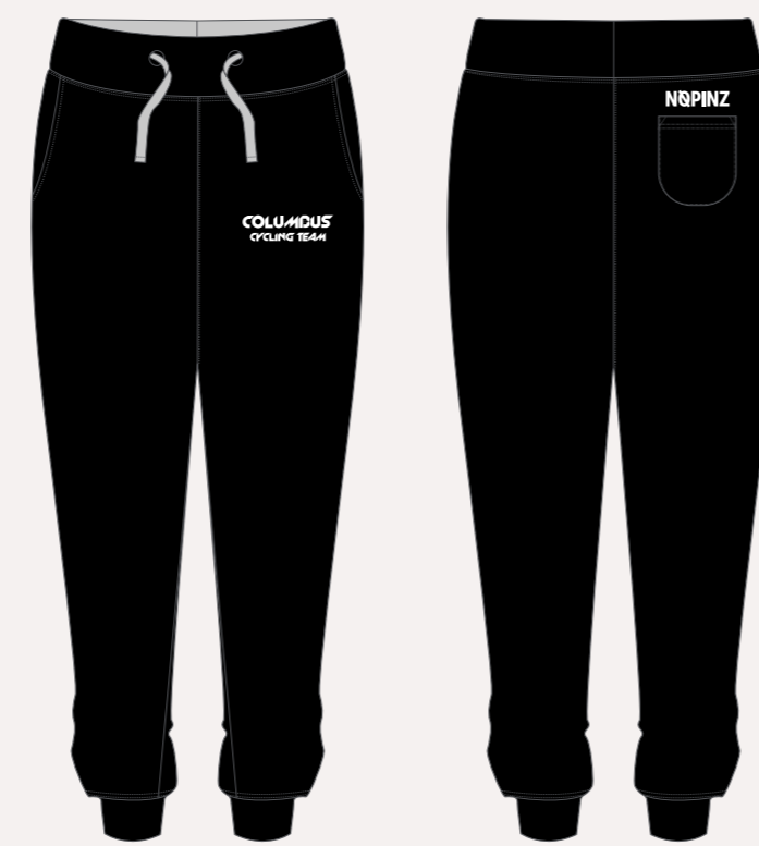
SLIM FIT CUFFED JOGGERS