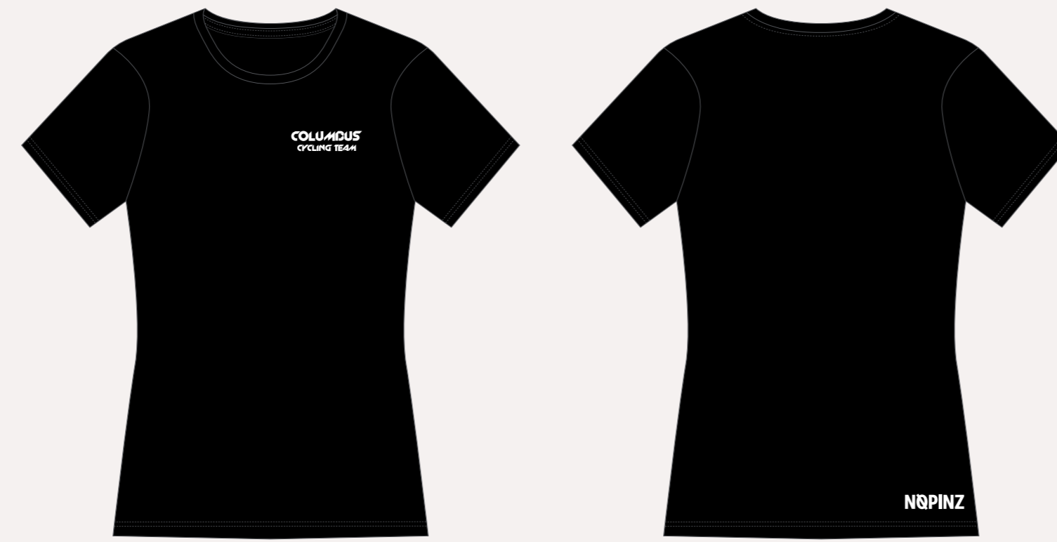
PERFORMANCE STRETCH T-SHIRT