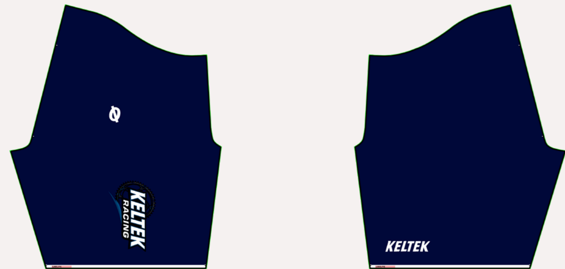
2D Production Template